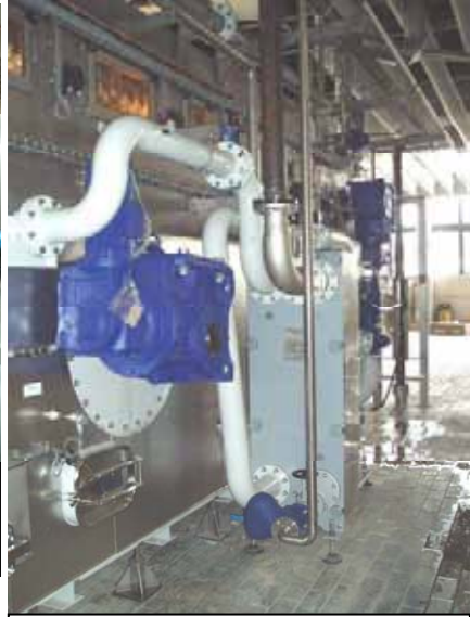
Heating by external plate heat exchanger (optional)