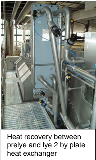
Heat recovery between prelye and lye 2 by plate heat exchanger